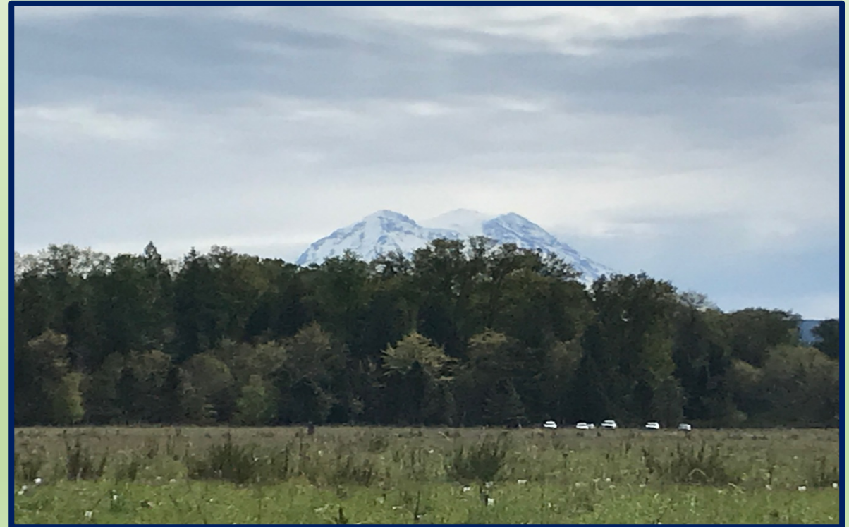
View from Powell Creek

THANK YOU for all the reported and unreported hours spent on Land Trust properties taking pictures and generally checkin' in, ensuring we are being good neighbors and caretakers of the land and supporting us in all the other ways you do!