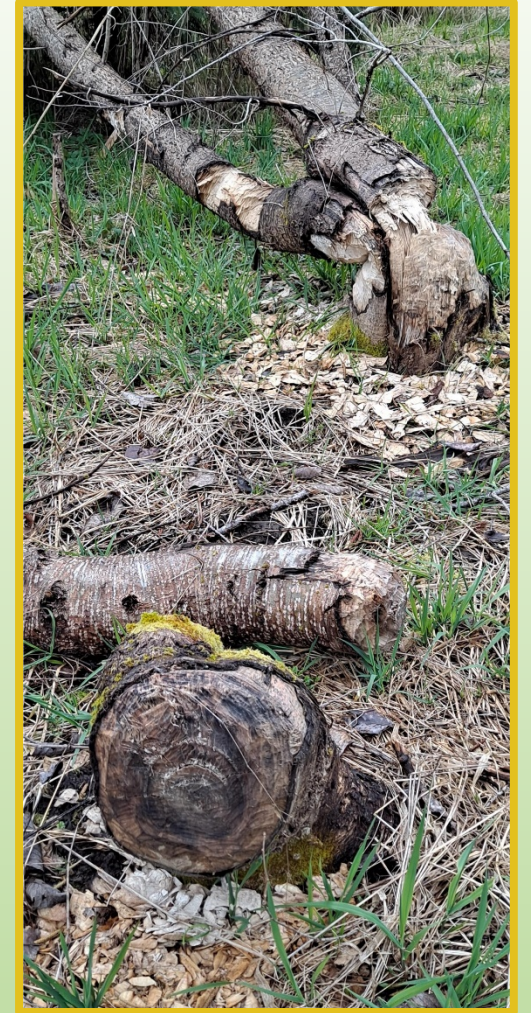
Busy Beavers in the Ohop