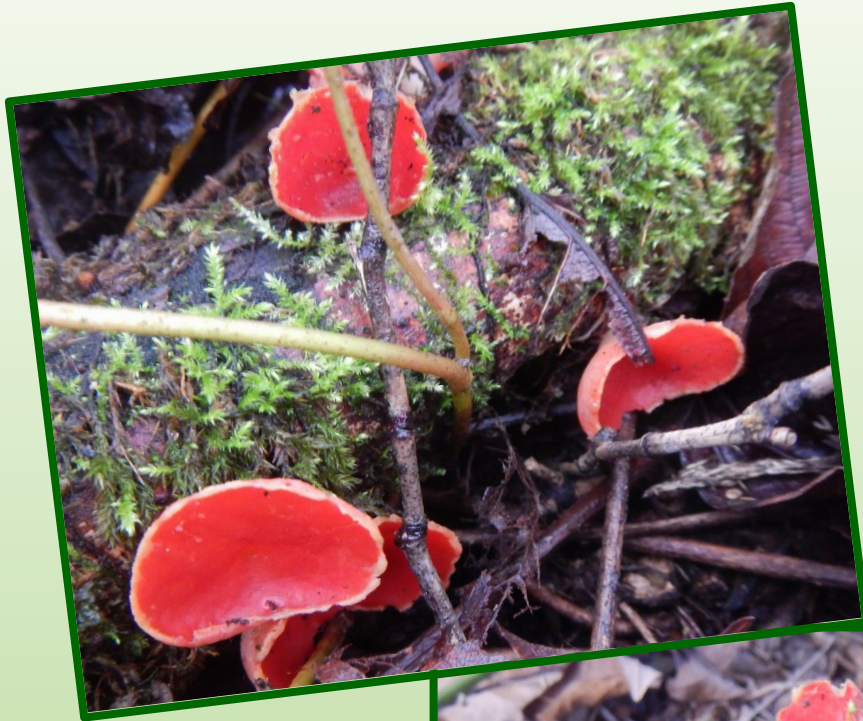
Cup-shaped mushrooms @Red Salmon Creek