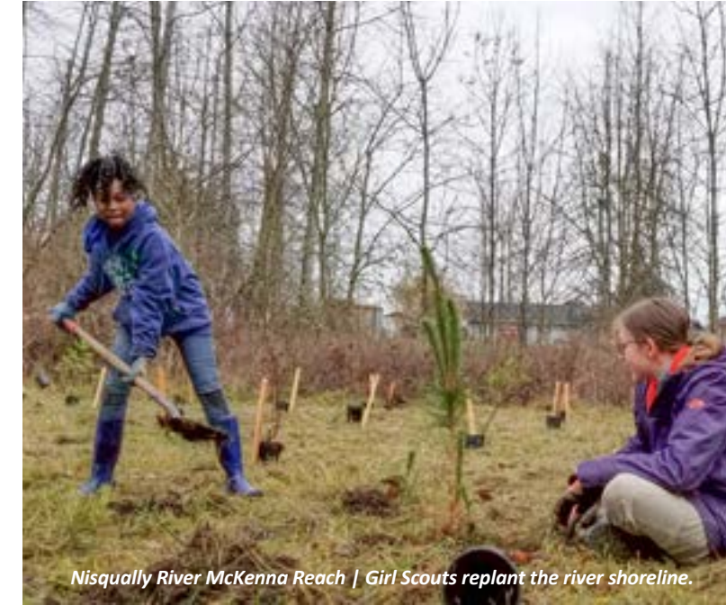
Nisqually River McKenna Reach | Girl Scouts replant the river shoreline.