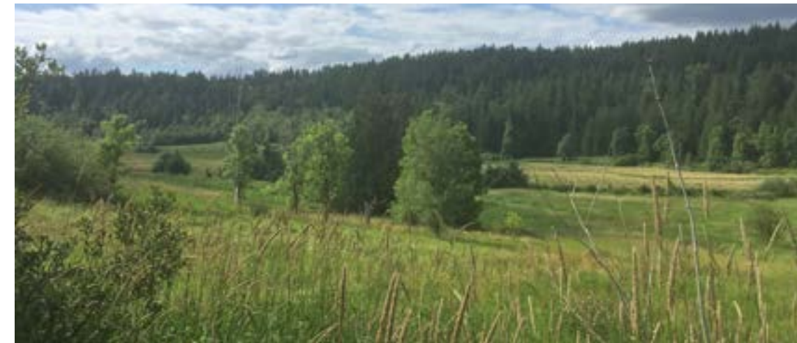
In 2019 we acquired these 90 acres and 1.1 miles of Ohop Creek shoreline for the next phase of the Lower Ohop Creek Restoration project, one of the largest stream-restoration projects in the state. See pages 3 & 4 for more land-protection news.