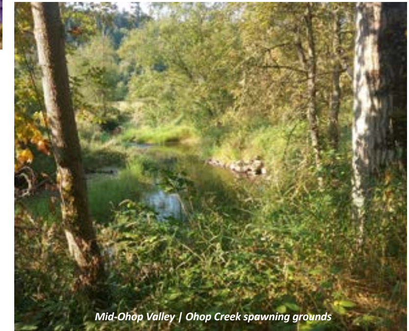
Mid-Ohop Valley | Ohop Creek spawning grounds

All five species of Pacific salmonids native to the Nisqually Watershed use Ohop Creek.