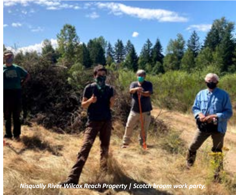
Nisqually River Wilcox Reach Property | Scotch broom work party.

As always, this level of success would not be possible without the support of our donors, volunteers and project partners. Thank you!