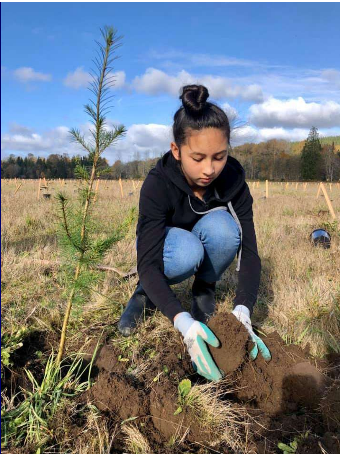
Nisqually River Education Project student planting at Powell Creek