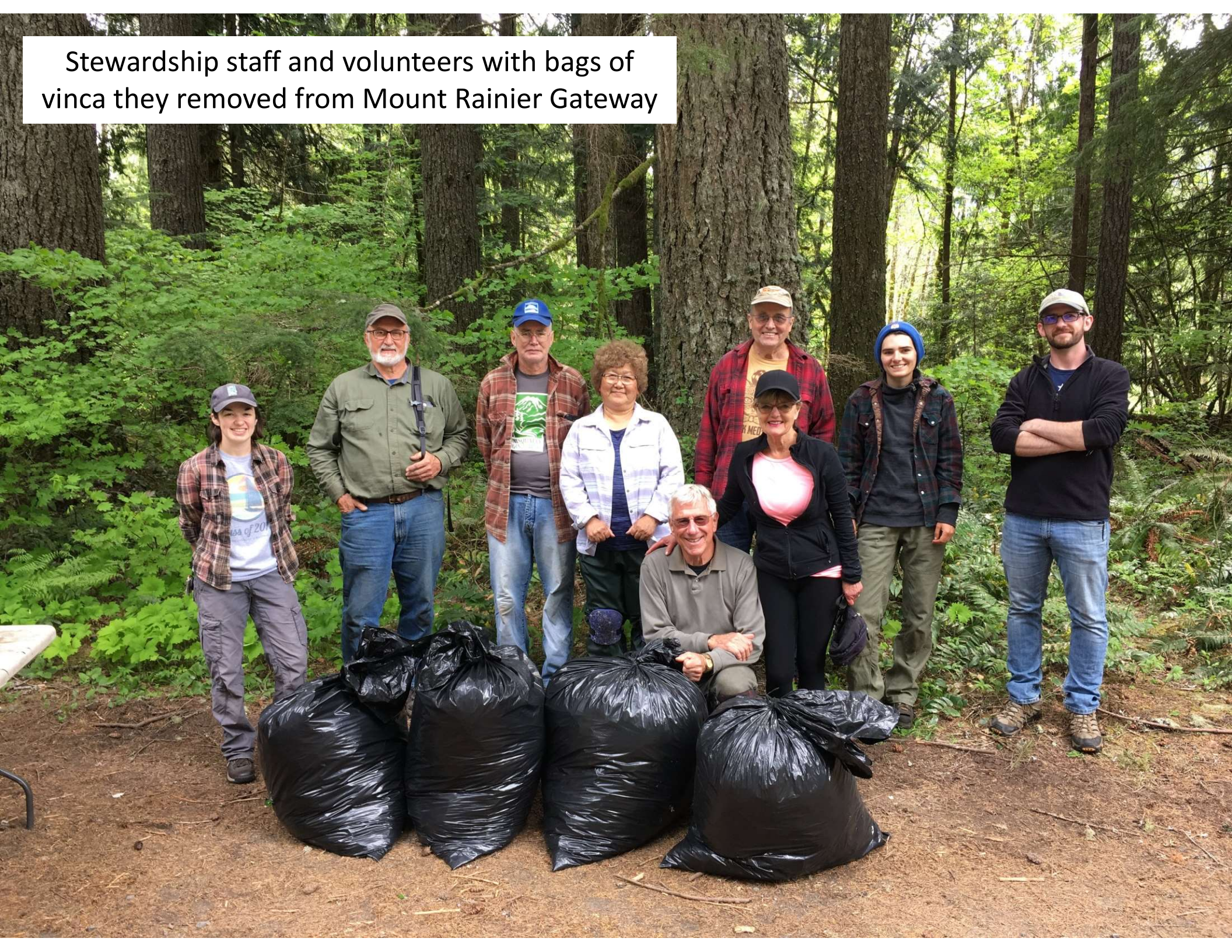
Stewardship staff and volunteers with bags of vinca they removed from Mount Rainier Gateway