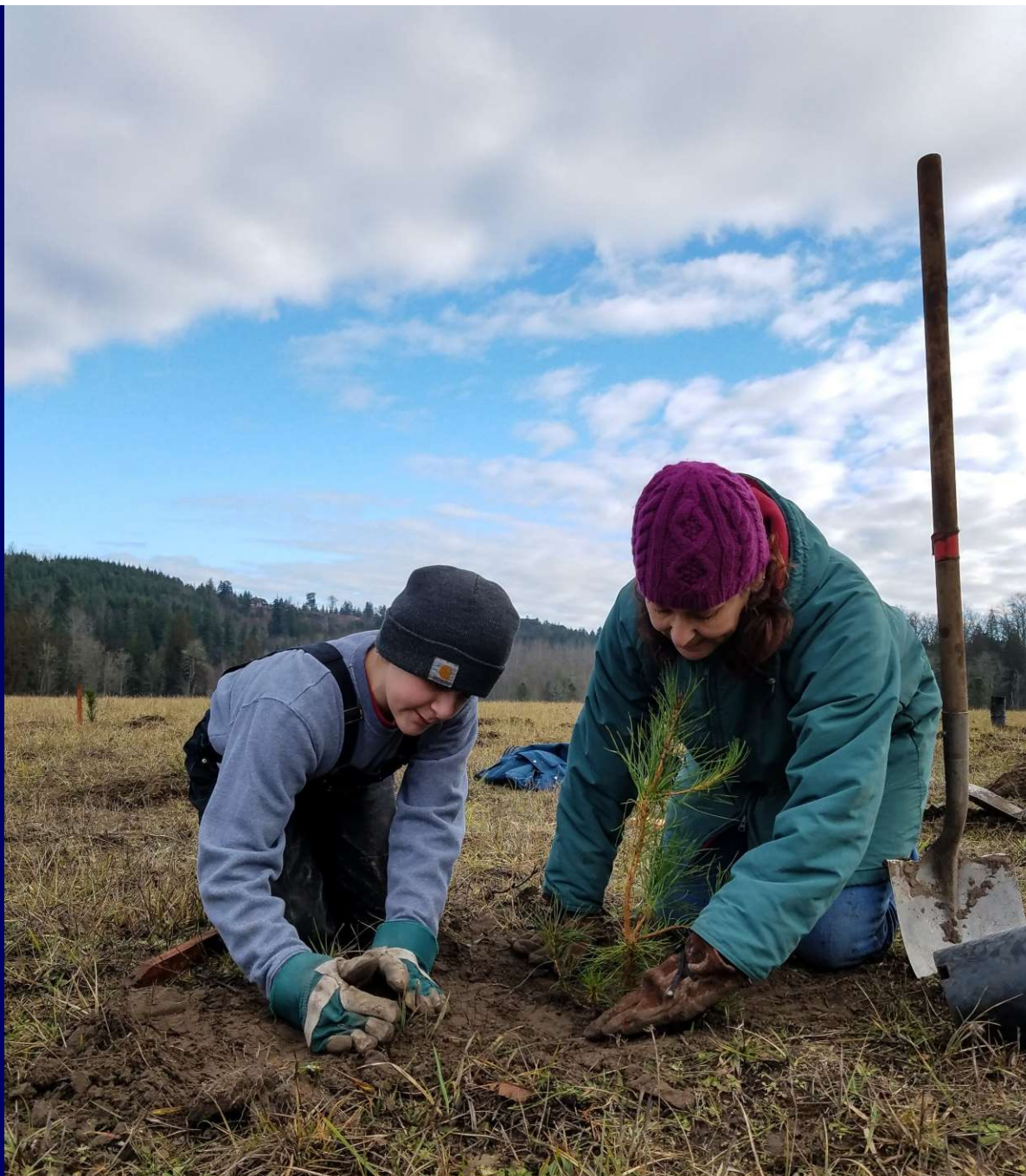
Volunteers working together to plant a shore pine at Powell Creek