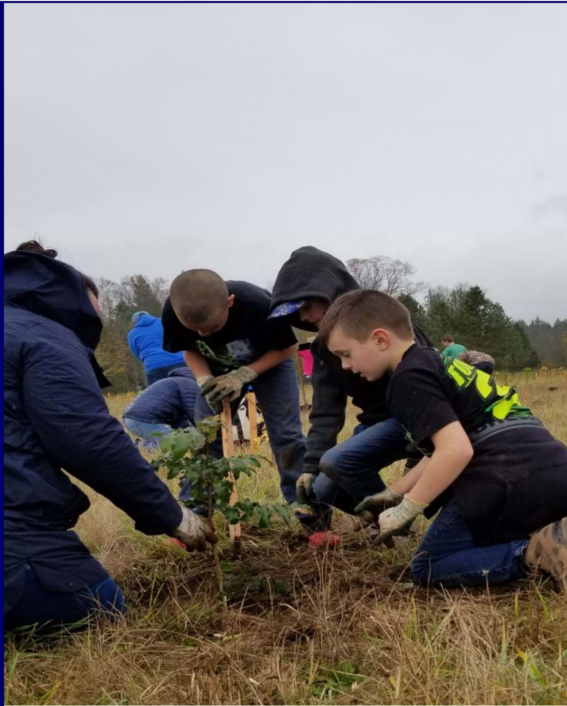
Nisqually River Education Project students plant Oregon grape at Powell Creek