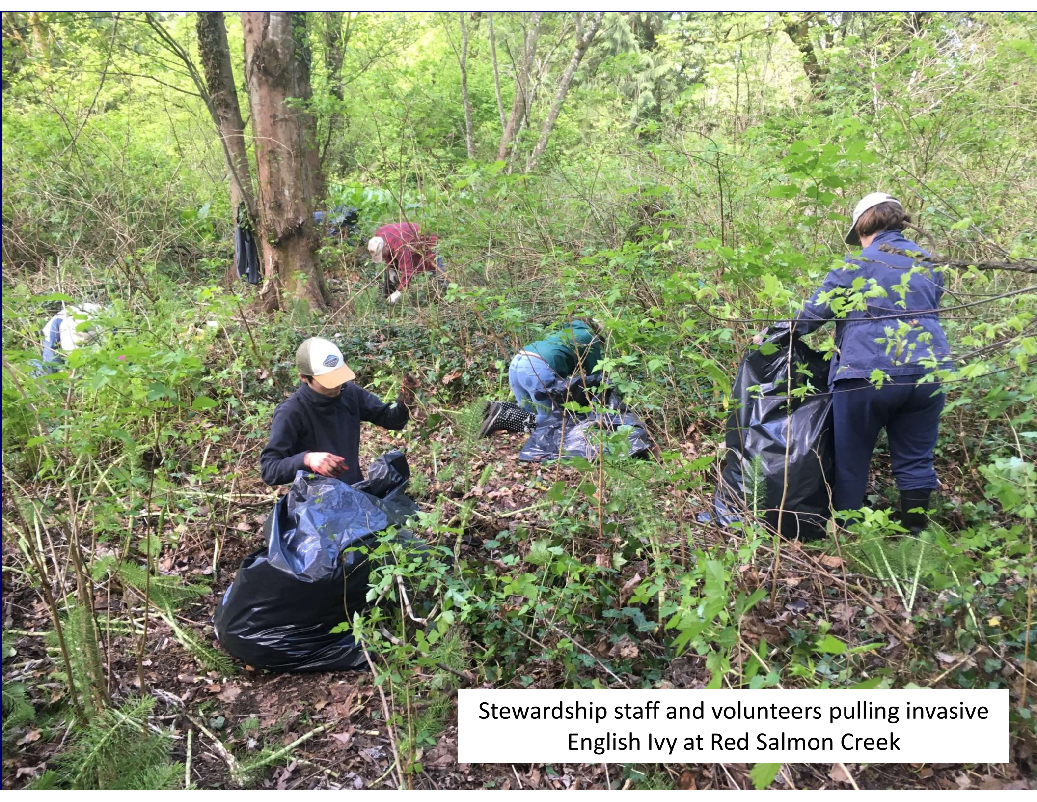
Stewardship staff and volunteers pulling invasive English Ivy at Red Salmon Creek