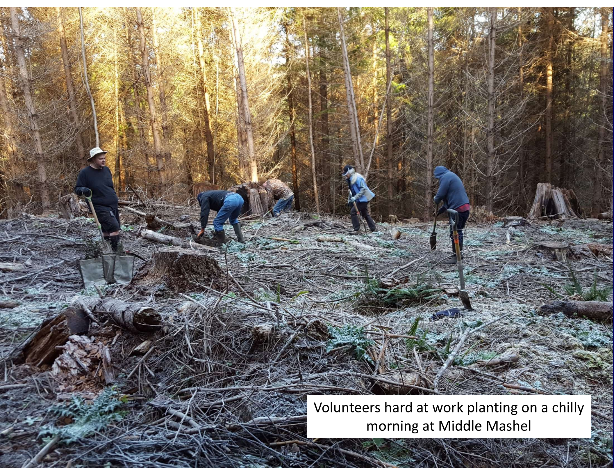
Volunteers hard at work planting on a chilly morning at Middle Mashel