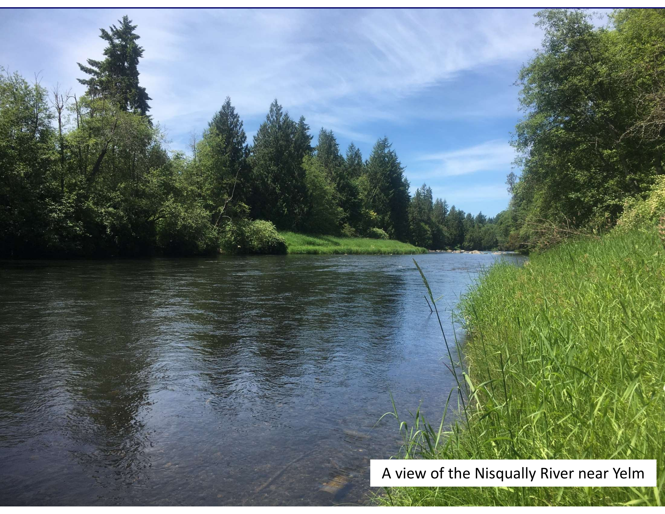
A view of the Nisqually River near Yelm