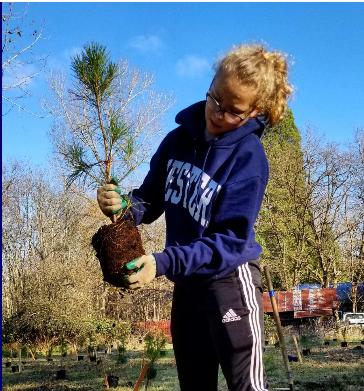
A Nisqually River Education Project student loosening the roots of a tree in preparation for planting