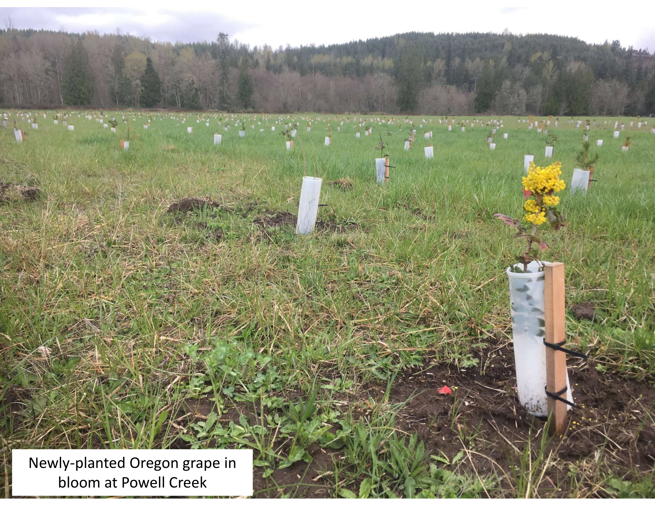
Newly-planted Oregon grape in bloom at Powell Creek