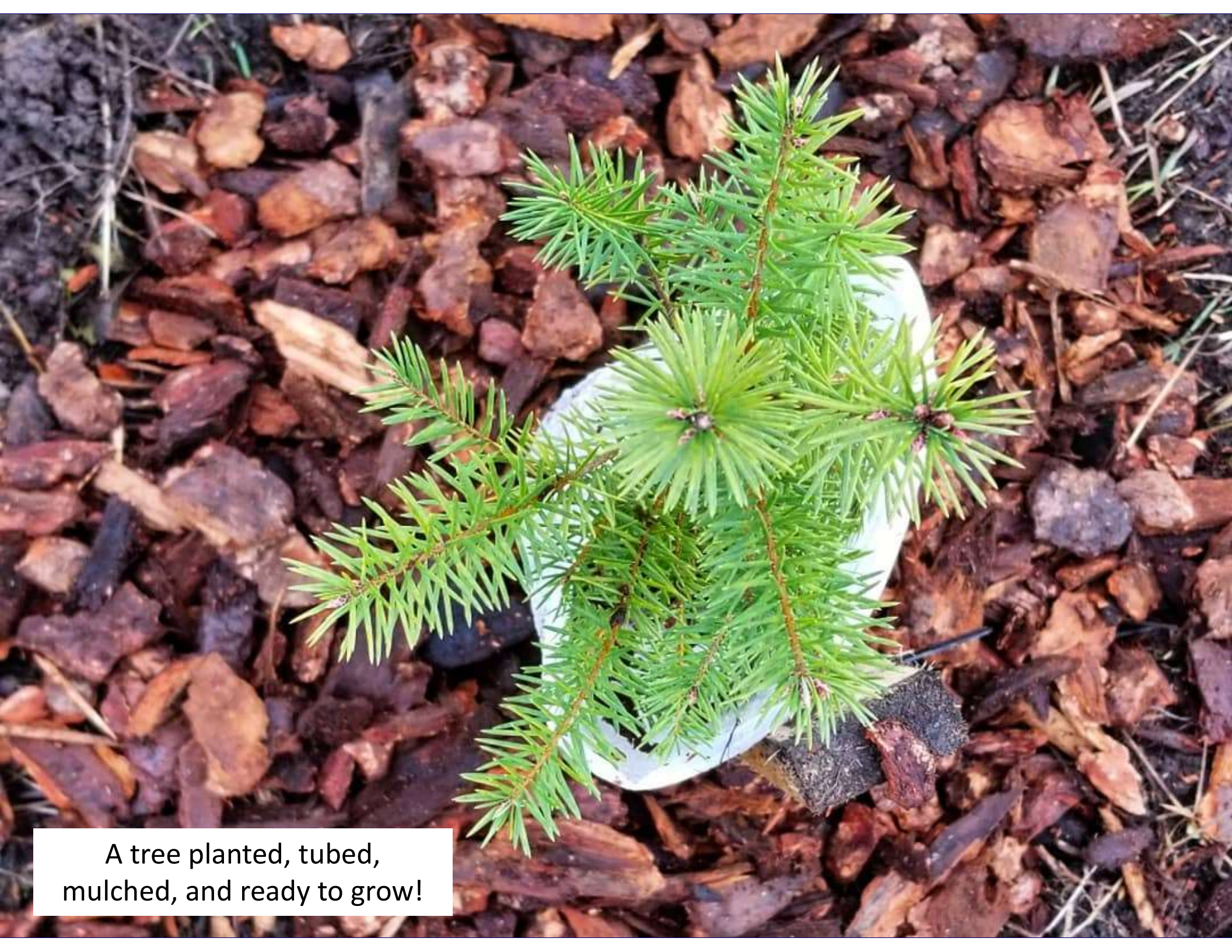
A tree planted, tubed, mulched, and ready to grow!