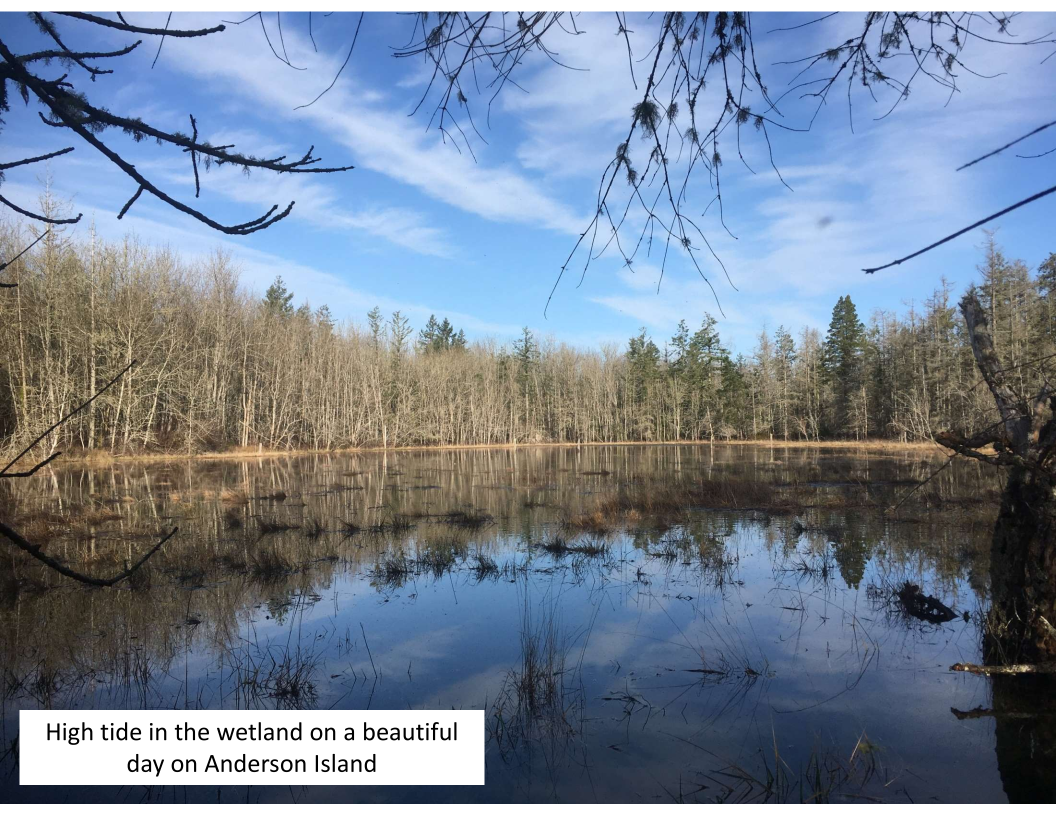
High tide in the wetland on a beautiful day on Anderson Island