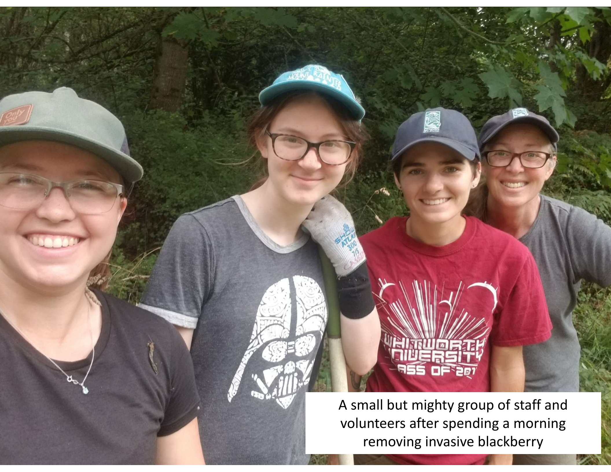
A small but mighty group of staff and volunteers after spending a morning removing invasive blackberry